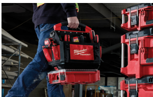
Optimized Storage Capacity