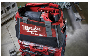
Spacious Storage Compartment