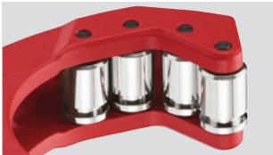
Chrome Rollers Rust Protection