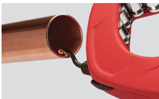
Built-In Reamer on 48-22-4252