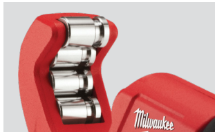
Chrome Rollers Rust Protection