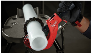
Adapt to Cut 3" PEX