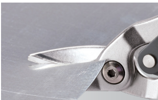
Flush Bolt Design Won't hang up on material