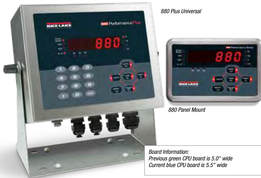
880 Plus Universal