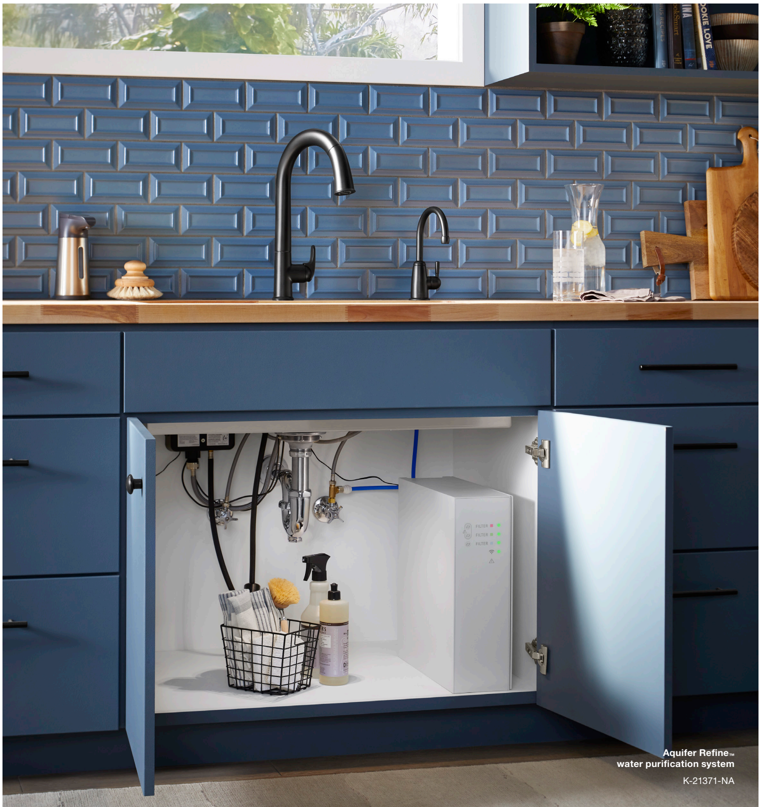
Aquifer Refine™ water purification system K-21371-NA

Aquifer® Refine Water purification system with KOHLER Connect.