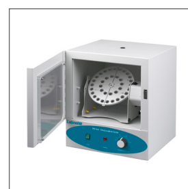
Mini Lab Roller with Mini Incubator