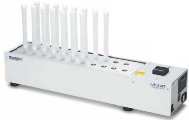
MICRODIST® Block and tubes

EPA method for Cyanide in both drinking and wastewater. Ammonia and phenolics are considered equivalent for NPDES.