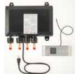
K-528-K-NA DTV Prompt Two-Outlet Valve

THE BOLD LOOK OF KOHLER ® KOHLER.com/dtvprompt