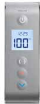
K-527-1CP Satin Chrome with Polished Chrome accents