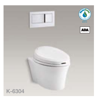
Veil wall-hung toilet with C3®-201 bidet seat