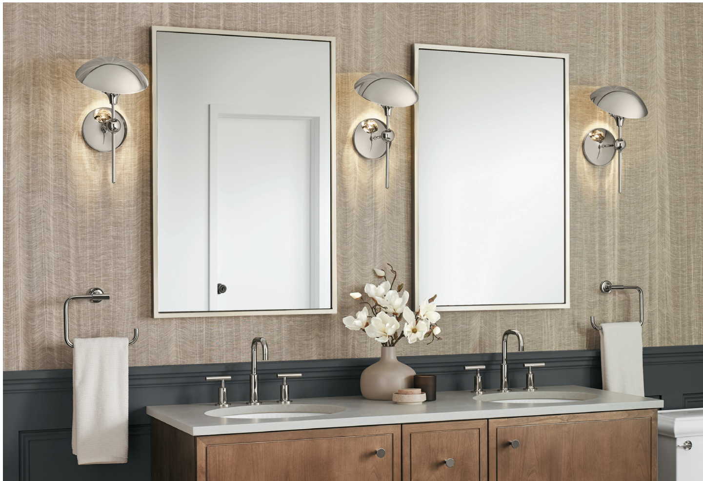
ONE-LIGHT SCONCE // 27944-SC01-SNL