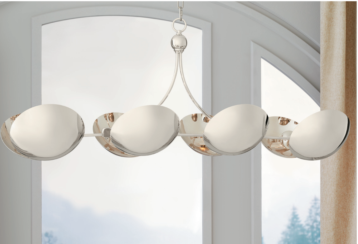
EIGHT-LIGHT LINEAR CHANDELIER // 27949-CH08-SNL

One-, two-, and three-light sconces bring an elevated touch to any room—especially a bathroom or powder room—while the eight-light linear chandelier is built to make a statement, making it the perfect centerpiece in a foyer or above a dining table.