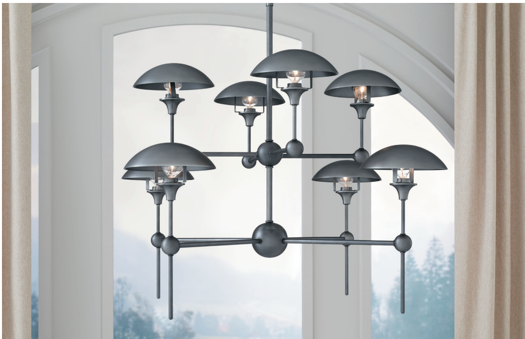
EIGHT-LIGHT CHANDELIER // 27951-CH08-GNL

Fixtures range from single- and multilight sconces to chandeliers.