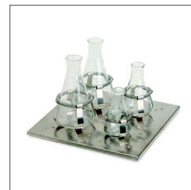
S2031-18 (clamps sold separately)