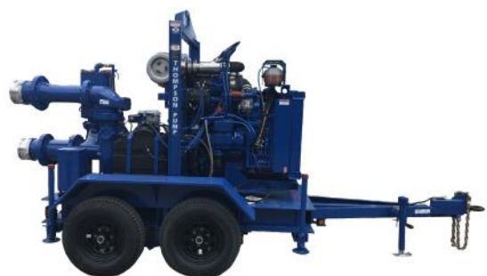
Photo shown may not be exact model. Consult factory for other options.

With its heavy-duty cast-iron construction and fast priming capabilities, the Thompson 8JSCE solids handling end suction centrifugal pump leads the industry in construction, industrial and municipal applications. The Thompson 8JSCE is designed for moderate flows up to 3,200 gpm and heads up to 273 feet making it perfect for sewage bypass pumping or general construction dewatering.