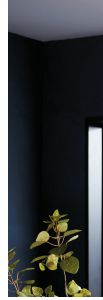
TEN-LIGHT CHANDELIER // 29380-CH10B-2GL