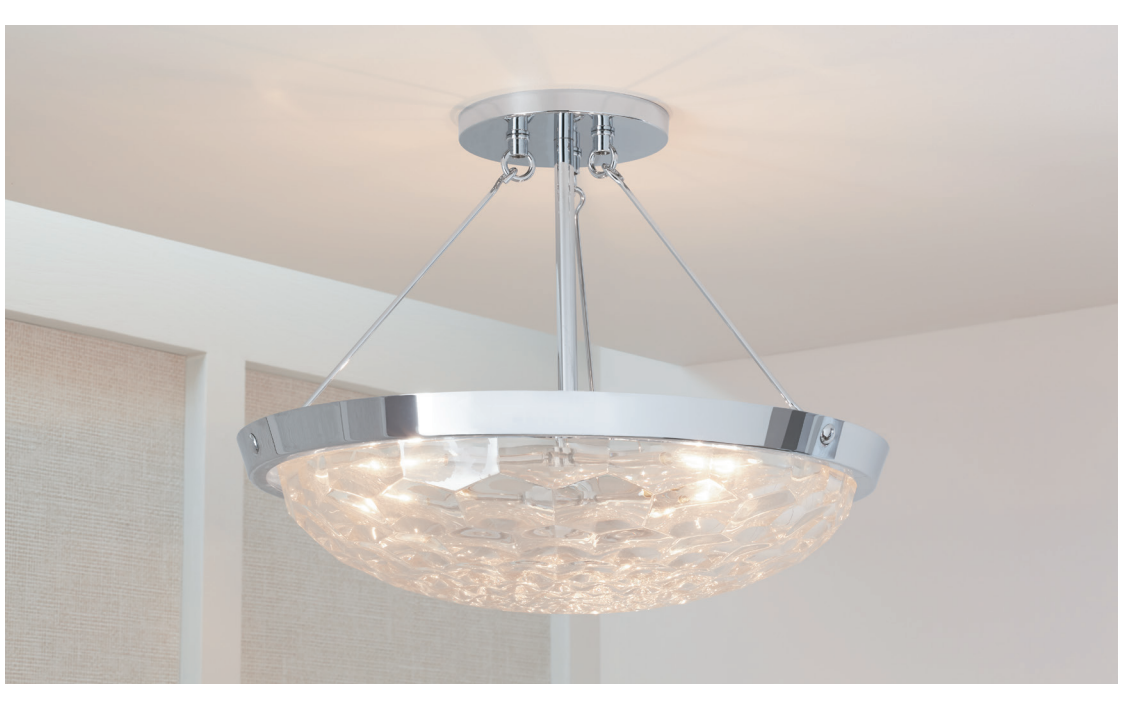
ONE-LIGHT SCONCE // 29375-SC01B-CPL | THREE-LIGHT SEMI-FLUSH // 29374-FM03B-CPL