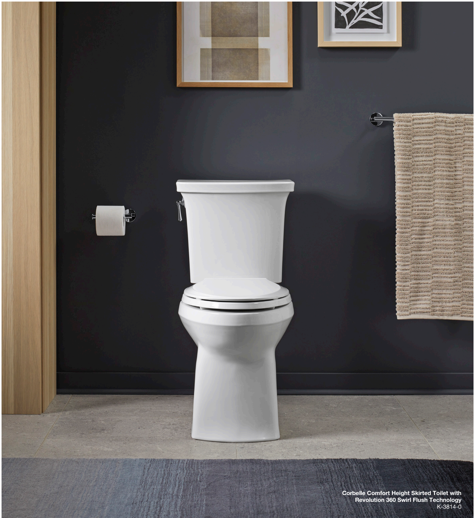
Corbelle Comfort Height Skirted Toilet with Revolution 360 Swirl Flush Technology K-3814-0