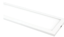
EdgeLink Flat Panel