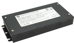
Adaptive Series Power Supply