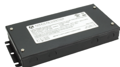
Adaptive Series Power Supply (30W | 60W | 96W | 192W | 288W)