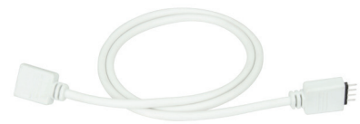
Interconnectable Linking Cables