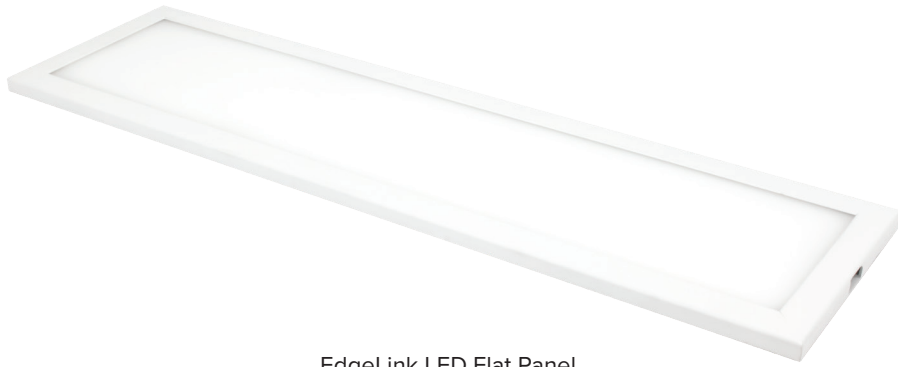
EdgeLink LED Flat Panel 3000K Warm White