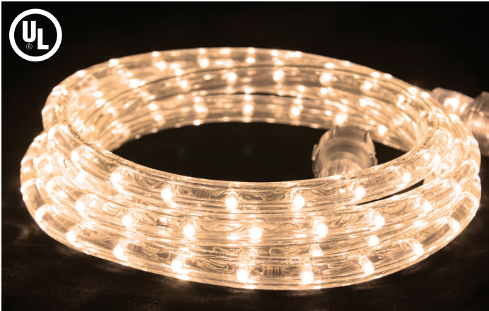
Warm White Kits 120V / 3000K / 72CRI / 32Lm/ft / 1/2" Diameter