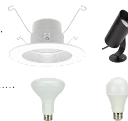
Spektrum+™ Smart Lights