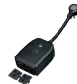
120V AC Outdoor Outlet Plug

TWINKLY™ PRO SPEKTRUM+ LIGHT STRING STRINGERS & REELS DECORATIVE BULBS ACCESSORIES LINEAR LIGHTING SPECIALTY LIGHTING ARCHITECTURAL