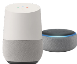
Voice Assistant (Not Included)