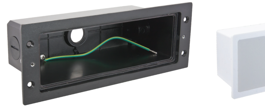
BRICK LIGHT ROUGH-IN HOUSING BB2-HSG