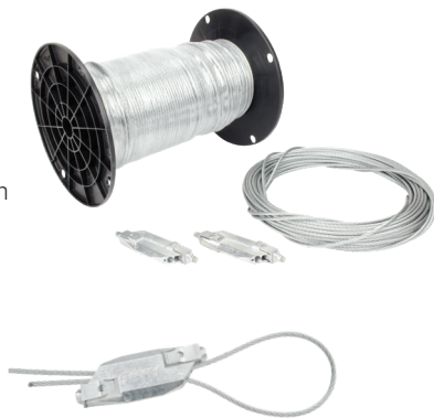
Heavy Duty Cable Lock Rated up to 330Lbs Loads