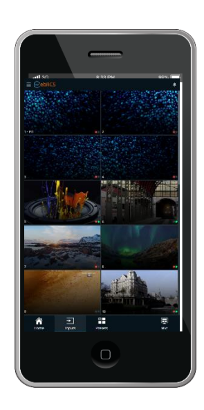
The Web RCS is compatible with any device or platform, including iOS and Android devices