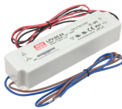
LED-DR 60 Driver (60W capacity)