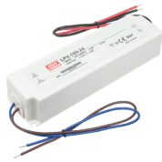
LED-DR 100 Driver (100W capacity)