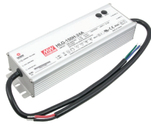
LED-DR 150 Driver (150W capacity)