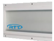
Industry-leading LED lighting