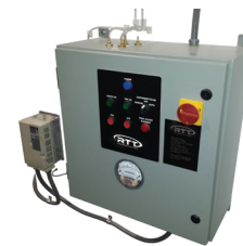
Control panel and VFD included