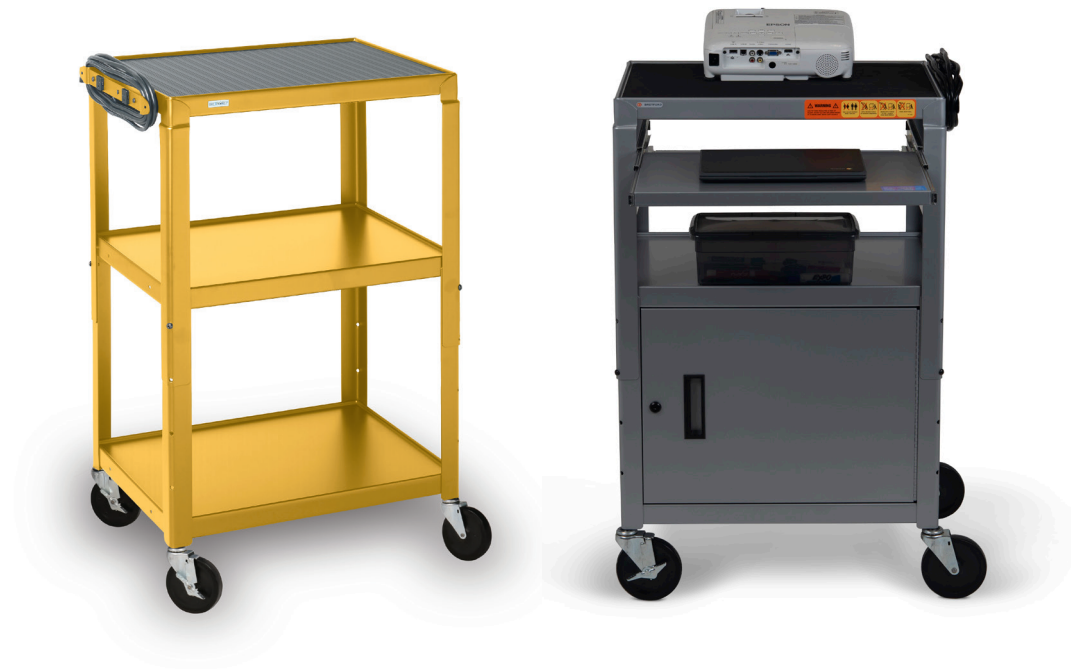
Adjustable Height Carts shown in Mustard (MUS) & Charcoal (CK)

Adjustable Height Carts are ideal for holding and transporting multimedia technology equipment. Easily move around open offices, presentation rooms, lecture halls, and classrooms.