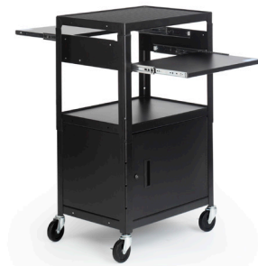
Adjustable Height Cart Model CA2642DNS