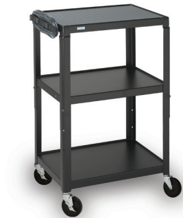
Adjustable Height Cart Model A2642E