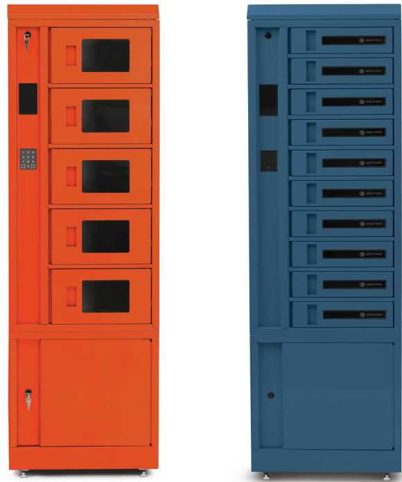
TechGuard Connect® Charging Lockers shown in Tangerine (TAG) and Topaz (TZ)

TechGuard Connect® Charging Lockers are Made in the USA to fit your exact needs and specifications. Choose your colors, choose your options, and choose peace of mind. Choose Bretford.