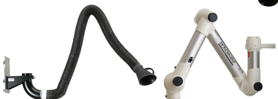
15000 Internal Support Arms