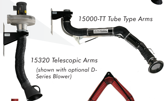
15000-TT Tube Type Arms