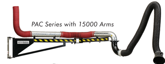
PAC Series with 15000 Arms