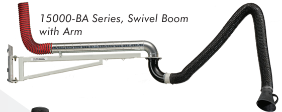
15000-BA Series, Swivel Boom with Arm