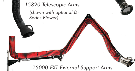
15320 Telescopic Arms (shown with optional D-Series Blower)