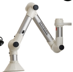
MNX Mini/Lab Arms