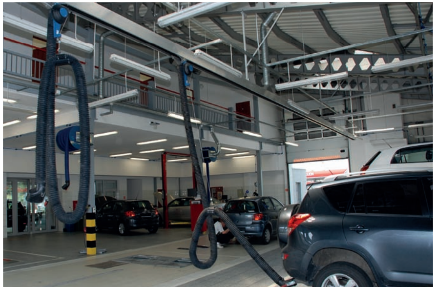
Technorail with 11000 Series Balancer Drop