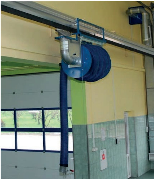
ALU150 Rail with Spring Hose Reel and Hose Reel Trolley