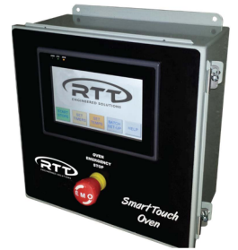
SmartTouch PLC Control Panel

RTT's new patent pending SmartBatch technology allows for "real-time" monitoring of part temperature. SmartBatch technology incorporates part temperature probes into the design of the batch oven and control panel for monitoring part temperature during the cure process. The information can then be used to control cure time cycle as well as document the part curing process, providing better control of the cure process.