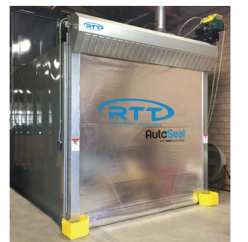
Optional AutoSeal roll-up door with patented air-tight sealing technology.