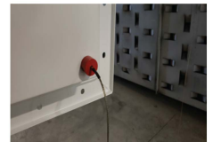
Optional SmartBatch part temperature monitoring