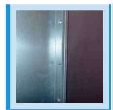
5/16" bolts with serrated lock nut