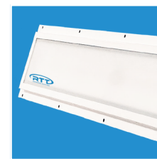
Industry-leading LED lighting with 5-year warranty