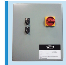
Optional UL & ETL listed control panel