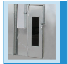
Windowed personnel access doors