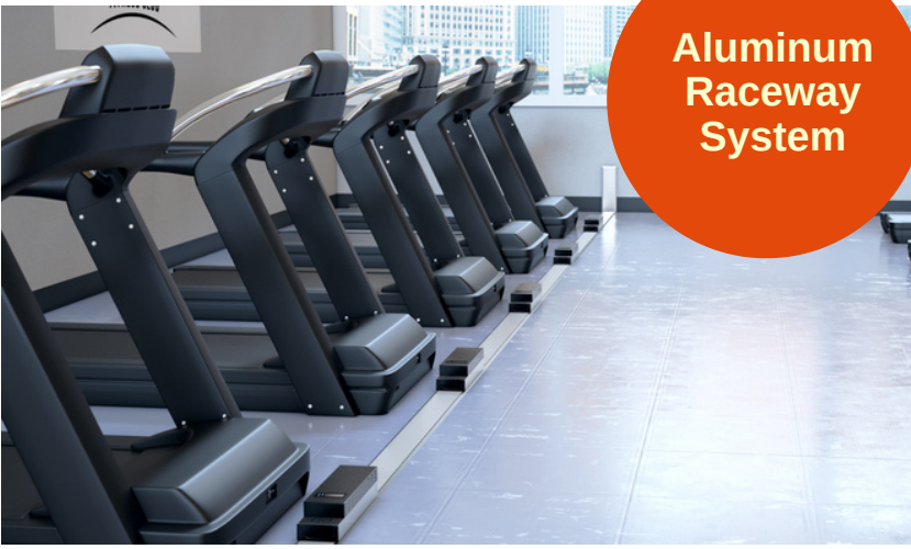
Aluminum Raceway System