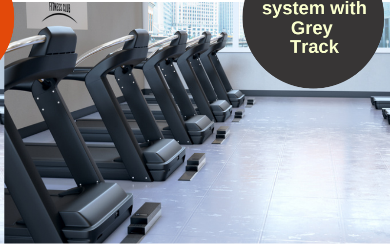
Standalone system with Grey Track