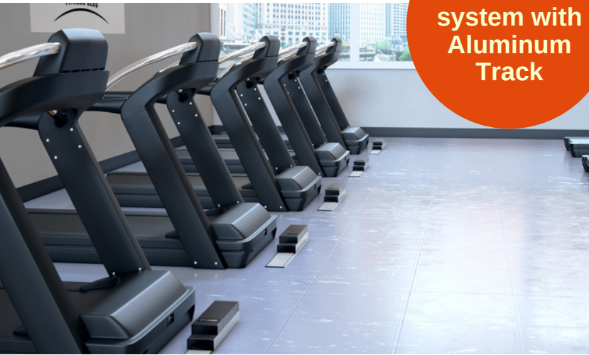
Standalone system with Aluminum Track