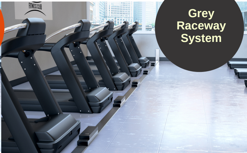
Grey Raceway System