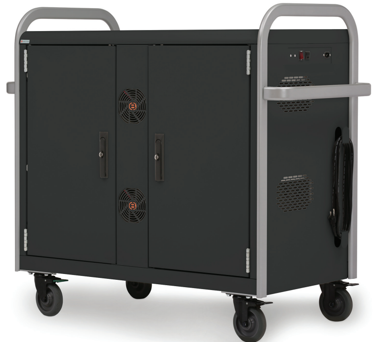
Link® Cart shown in Charcoal (CK)

Keep laptops secure, charged and up to date. This rugged Link® Cart is equipped with Ethernet cables, dedicated space for a rack-mount network switch, and two fans for cooling making it easy for IT administrators to push updates to all devices simultaneously.