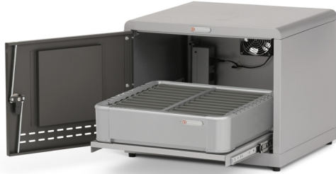
PowerSync Pro™ Gen. 2 Cabinet PSPCAB-PMCK