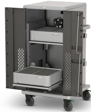
PowerSync Pro™ Gen. 2 Cart PSPCART-PMCK