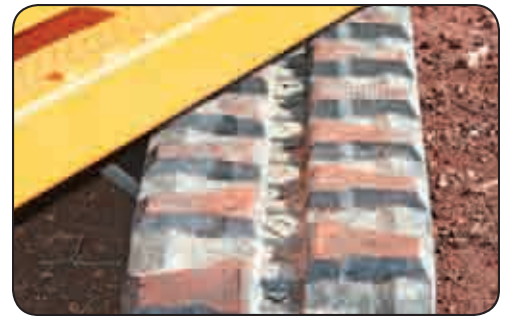
Caterpillar Rubber Track Undercarriage provides optimal traction in all situations.

The rubber tracks used on the Hurricane TRX are at home on both clearing sites and turf. The long and wide footprint of the Caterpillar tracks minimizes ground pressure. This allows the machine to float across soft ground, getting you to stumps that would otherwise be inaccessible. Another advantage of the rubber track system is the minimal damage done to asphalt or concrete. The rubber tracks truly do minimize damage to any surface!