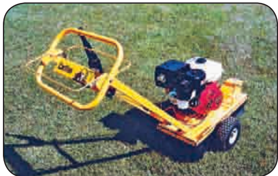
Lightweight and easy to maneuver from stump to stump.

The 900 Series utilizes industry standard cutter teeth, which makes replacement simple and very cost effective. Its small size coupled with its commercial grade construction and strong performance make the Carlton 900 a perfect choice for rental companies and top professionals alike.