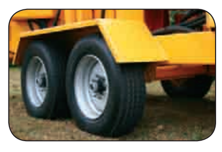
Two 9000 Pound Capacity Dexter Axles with electric brakes on both axles make the 2018HD tow great while minimizing tire wear.