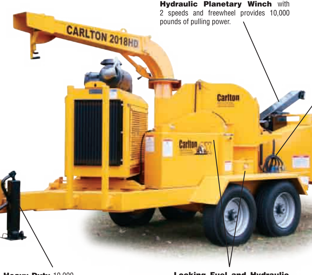
Heavy Duty 10,000 pound tongue jack.