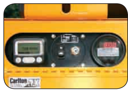
Digitally Controlled Reversing Autofeed Plus monitors engine rpm and adjusts the feed automatically. This system has the ability to start, stop, and reverse the feed of material into the chipper based on parameters set by the operator.