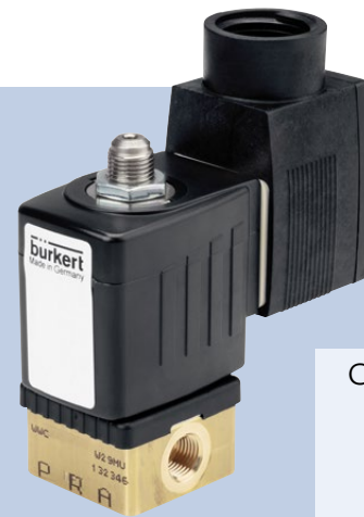
Shown with 2509 plug