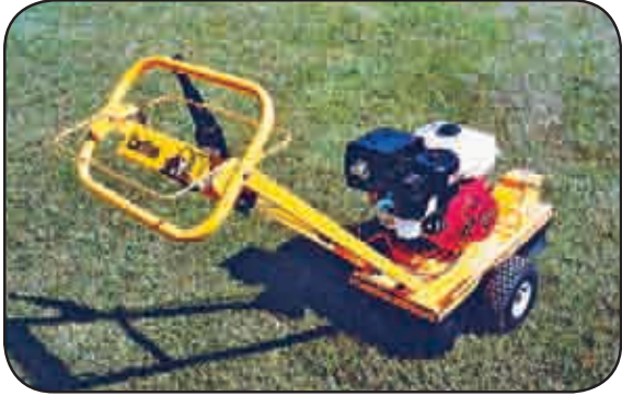
Lightweight and easy to maneuver from stump to stump.

The 900 Series utilizes industry standard cutter teeth, which makes replacement simple and very cost effective. Its small size coupled with its commercial grade construction and strong performance make the Carlton 900 a perfect choice for rental companies and top professionals alike.