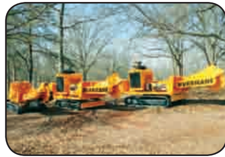
Carlton manufactures 3 track models which work in a combination of residential and clearing applications, the compact SP8018 TRX, the highly versatile Hurricane RS, and the awesome Hurricane TRX.

Carlton's Hurricane RS inherits many of the performance features of the larger TRX with an emphasis on Residential Service. The Hurricane RS is shorter, narrow, lower, and lighter than the land clearing TRX yet rivals it in production.