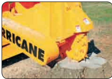
High Horsepower John Deere Diesels coupled with Carlton's patented drive system allows the operator to take a 6-inch bite in every pass.