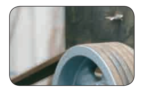
Kevlar Construction Belts carry more horsepower with less stretch, lowering maintenance costs and prolonging belt life.