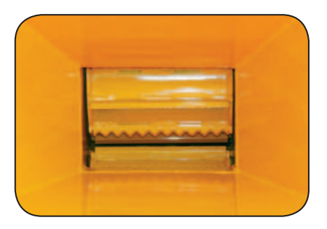
10 ½" Diameter Feed Roller aggressively pulls in the material to be chipped. This extra large diameter feed roller climbs over material easily, pulling it into the chipper with no assistance. The high torque bottom roller aids in the feeding.

Led Taillights mounted high on the infeed out of harms way. The 1260's taillights have heavy duty covers for extra protection. All the wiring runs inside the frame to give the machine a neater appearance and keep wires clear of damage.