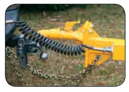
Adjustable Height Hitch easily adjusts to different tow vehicles to keep the chipper level and aid in safe towing.