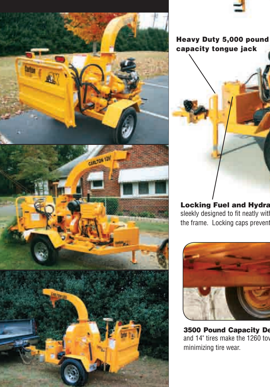
Locking Fuel and Hydraulic Tanks are sleekly designed to fit neatly within the confines of the frame. Locking caps prevent vandelism.

Swivel Discharge quickly and easily allows the operator to fill chip trucks corner to corner, or direct the chips to a precise place on the lot.