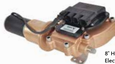
8" Heavy Duty Electric Actuator