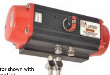
Air Actuator shown with factory supplied Air Control Valves