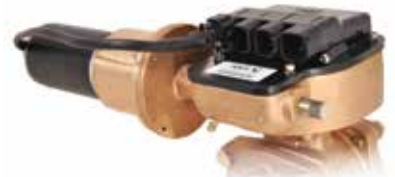
Electric Actuator shown mounted on a Swing-Out Valve