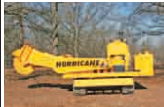
Carlton's patented turret bearing design provides the Hurricane TRX with 360-degree continuous rotation. This gives the Hurricane TRX massive cutting dimensions, allowing the machine to cut a full 19-foot width.