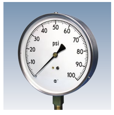
Model 5105 Mechanical Contractors Gauge: Easy to read 4½" gauge size ● Corrosion resistant SST case ● Accuracy: ± 1½ to 1 to 1½% Grade A