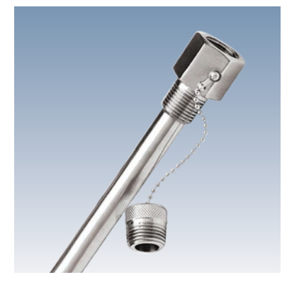
Thermowells: General Use, Lagging Extension, Heavy Duty, & Limited Space • 316 SST • Standard lengths from 2½" through 12"