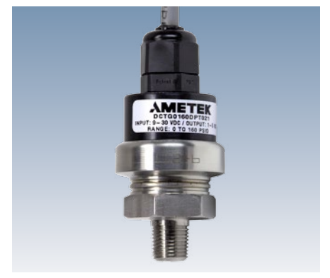
Model DCT Digital Transducer: Vacuum, compound, and gauge pressure ranges • Accuracy: ± 0.2% full scale (BFSL) • Outputs 4-20 mA, 1-5 VDC, 1-6 VDC, 0-5 VDC