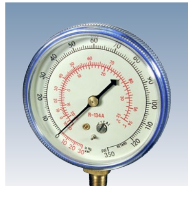
Model 1785 Refrigerant Manifold Gauge: Red and blue cases to match A/C hoses • Refrigerant ranges include R-12, R-22, R-502, R-134A, and R-410A in stock • Easy access to recalibration screw