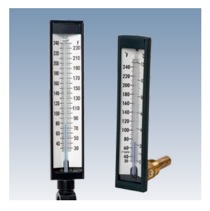
Model T-571 & T-572 Glass Tube Thermometers: 9" adjustable angle • 5½" low mount or low back mount connections • Dual temperature scales in °F & °C