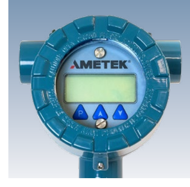
Model DT-8300 EX Explosion Proof Digital Thermometer: FM approved Explosion Proof • NEMA 4x housing • Battery powered or line powered