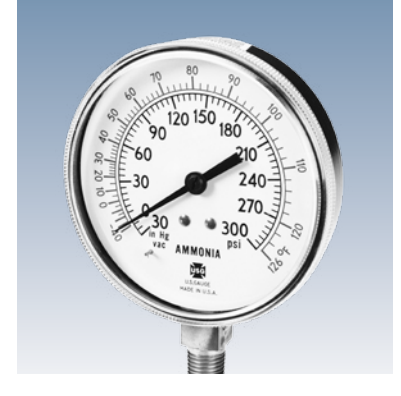
Model 1706 Ammonia Refrigerant Gauge: Ammonia compressor and refrigerant system specific • Silicone dampened movement extends gauge life • Pressure/Temperature scale dial