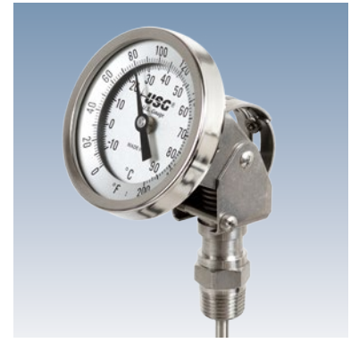
Model ADJ Adjustable Bimetric Thermometer: 3" or 5" dial sizes • Standard stem lengths from 2½" through 12" • Custom stem lengths available