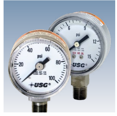
Model 1521/1522 Corrosion Resistant Gauges: 316L SST wetted parts • 304 SST corrosion resistant case • 1½" and 2" LM and CBM versions