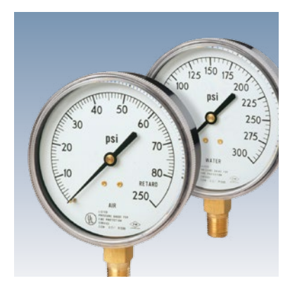
Model 1590 Sprinkler Gauge: FM approved, UL listed • Large, easy to read 3½" gauge size • Air and water units in stock