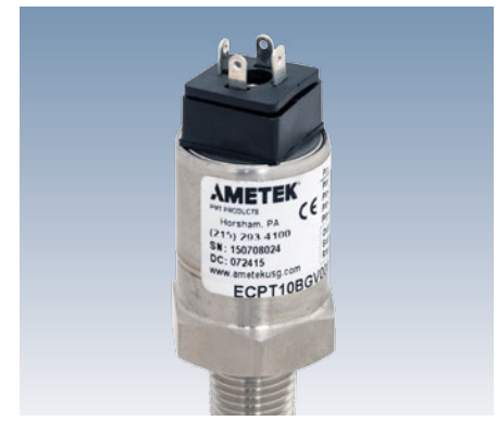
Model ECPT10 Low Cost Transducer: Pressure ranges: Vacuum to 0 psi through 0-10 000 psi • Accuracy: ± 1% full scale (BFSL) • Fatigue life: over 4 million cycles