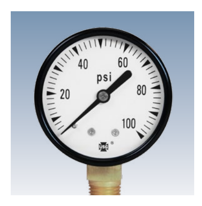
Model P500 Low Lead Utility Gauge: Low cost • Adheres to the US Congress "Reduction of Lead in Drinking Water Act" • 1½" and 2" low mount and center back