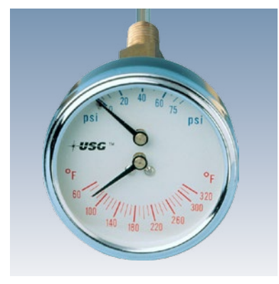
Model PT-1088 Boiler and Heater System Gauge: 2½" gauge size • Dial reads 0-75 psi/60-320° F • Short shank 0.78" or long shank 2.02"