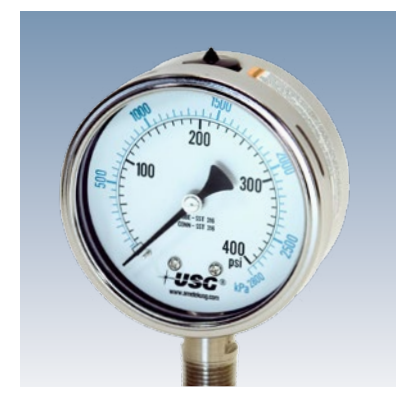
Model 1550 Liquid Filled Gauge with 316 SST Internals: 316 SST internals with SST case • 2½" and 4" gauge sizes • Dual scale psi/kPa dials