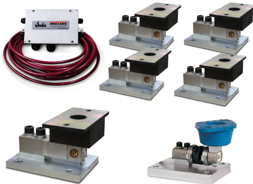
NTEP Certified 1,000lb load cell shown.