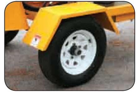
Full 14-inch Tires allow the 660 to be towed at highway speeds.