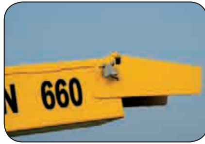
Adjustable Chip Deflector puts the chips right where you want them.