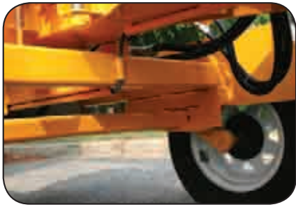
2,000-Pound Dexter Torflex Axle makes the Carlton 660 tow securely.