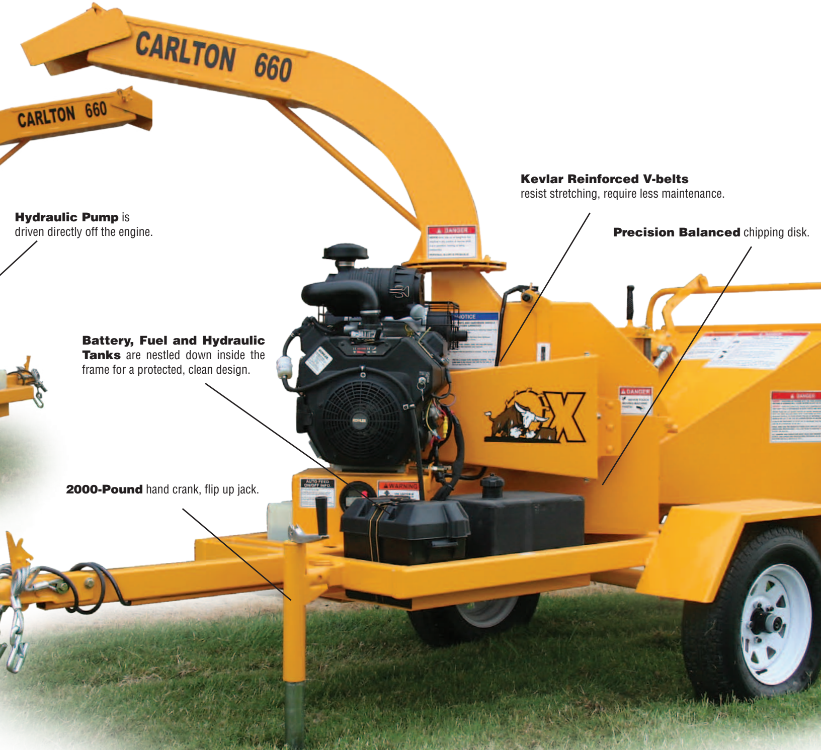
Hydraulic Pump is driven directly off the engine.