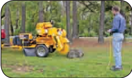
Optional Wired Remote distances the operator from dust, noise and flying debris.

The 3500D, with its economical price, solid construction and powerful diesel options, is an unmatched value.