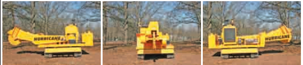
Carlton's patented turret bearing design provides the Hurricane TRX with 360-degree continuous rotation. This gives the Hurricane TRX massive cutting dimensions, allowing the machine to cut a full 19-foot width.