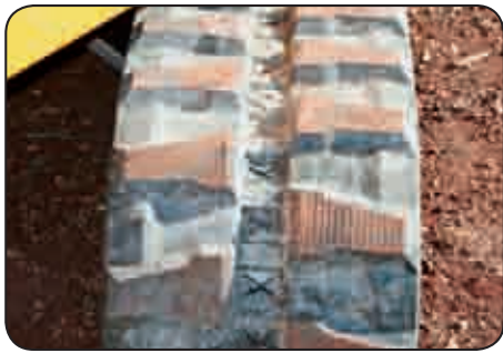
Caterpillar Rubber Track Undercarriage provides optimal traction in all situations.