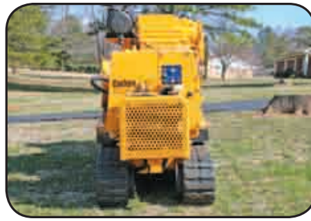
Narrow 35-inch stance allows the SP7015 TRX to get into tight spaces.