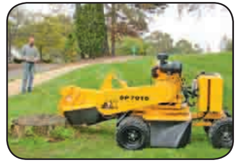
Wired and Wireless Remote Control: Remote option keeps the operator out of the dust, debris and noise.

The SP7015 is the most powerful and versatile self-propelled portable grinder made; combining the convenience of a narrow 35-inch backyard machine with the high horsepower of a tow-behind unit to create an extremely productive stump cutter.