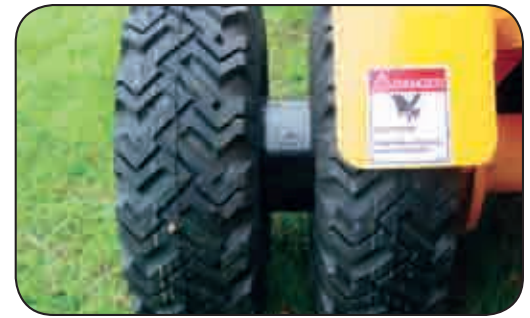
Optional Dual Wheels are easily removed. One bolt and you are through the back gate.

This compact machine has a width of 35 inches, allowing it to fit easily through standard backyard gates. The SP4012 incorporates many of the features found in larger Carlton models including a direct drive hydraulic pump, hardened bushings and shafts, counter balance valves on the lift, swing and hydraulic drive circuits.