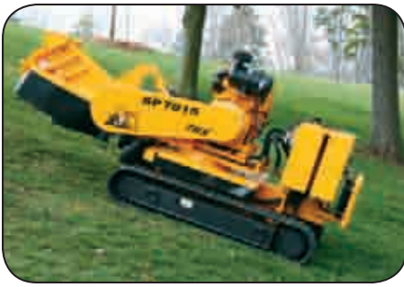
Four Speed Ground Drive System provides variable travel speeds up to 3.5 MPH!