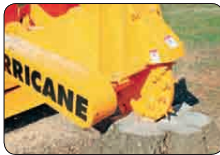
High Horsepower John Deere Diesels coupled with Carlton's patented drive system allows the operator to take a 6-inch bite in every pass.