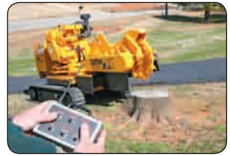
Wireless Remote Control keeps the operator out of the dust, debris and noise.

The SP7015 TRX is truly a go anywhere do everything machine.