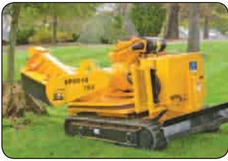
Patented Turntable Design provides a low center of gravity and allows for a giant 70-inch swing travel.