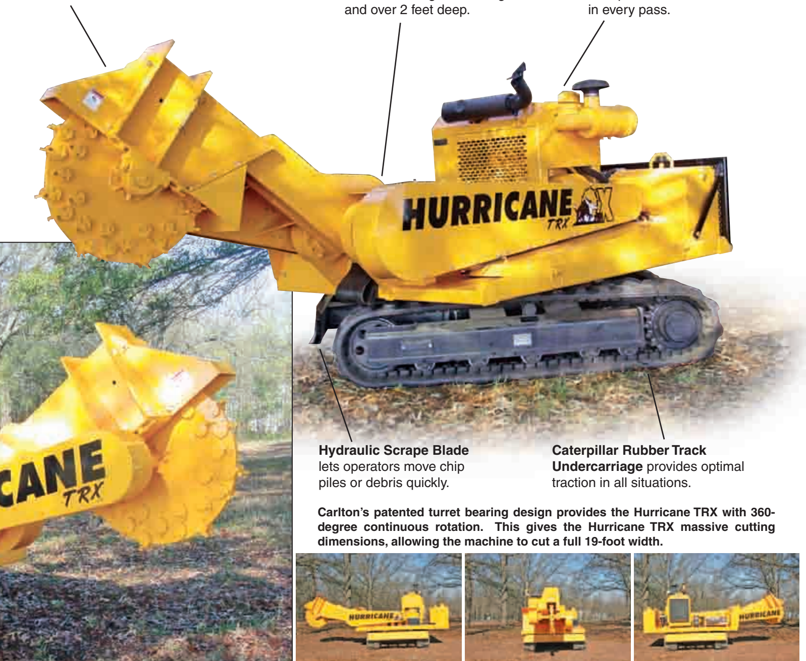
Hydraulic Scrape Blade lets operators move chip piles or debris quickly.