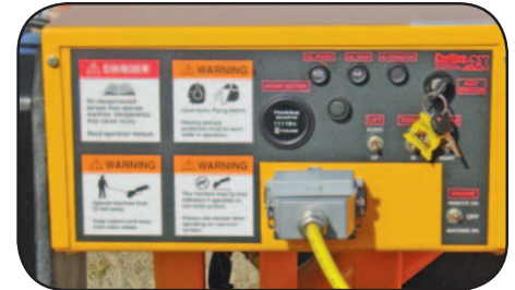
Optional Remote Control

Five Feet of Tongue Extension allows the 7500 to cut the largest stumps without repositioning.