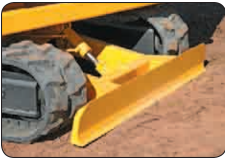
Hydraulic Scrape Blade aids in quick clean up.