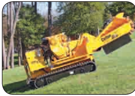
Four Speed Ground Drive System provides variable travel speeds up to 3.5 MPH!