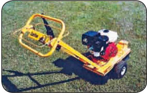
Lightweight and easy to maneuver from stump to stump.

The 900 Series utilizes industry standard cutter teeth, which makes replacement simple and very cost effective. Its small size coupled with its commercial grade construction and strong performance make the Carlton 900 a perfect choice for rental companies and top professionals alike.