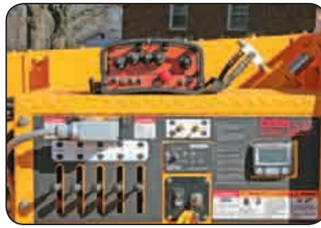
Proportional Wireless Remote Control allows operation from auxiliary equipment such as a Bobcat or pickup truck at a distance of more than 1,500 feet.