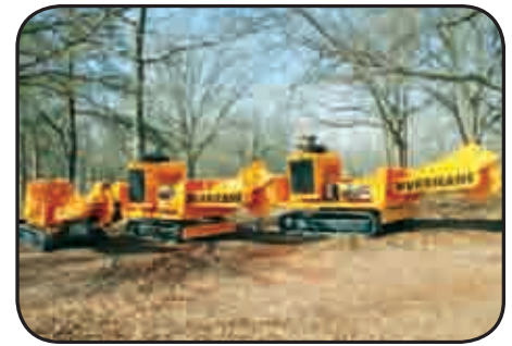
Carlton manufactures 3 track models which work in a combination of residential and clearing applications, the compact SP8018 TRX, the highly versatile Hurricane RS, and the awesome Hurricane TRX.

Carlton's Hurricane RS inherits many of the performance features of the larger TRX with an emphasis on Residential Service. The Hurricane RS is shorter, narrow, lower, and lighter than the land clearing TRX yet rivals it in production.