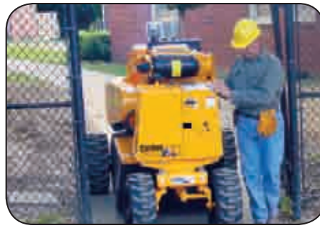
SP7015 brings high horsepower into tight places.