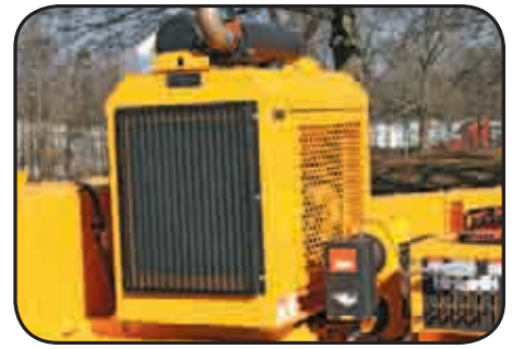
Up to 250-horsepower is available to meet customers productivity needs and stay within budget.