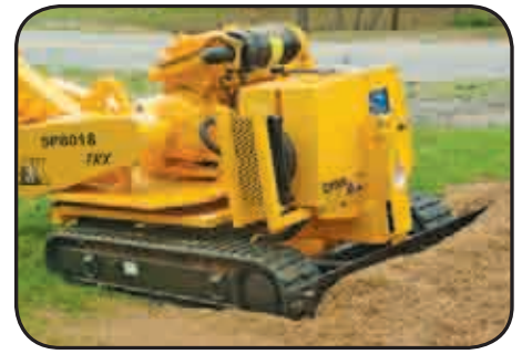
Hydraulic Push Blade makes quick work out of clean up.

The SP8018 TRX provides 78-horsepower and features a wireless remote control, four speed ground drive capabilities, and traction control. With cutting dimensions of 43-inches above ground, 18-inches below ground, and an 80-inch sweep, this machine is unmatched in power and performance.