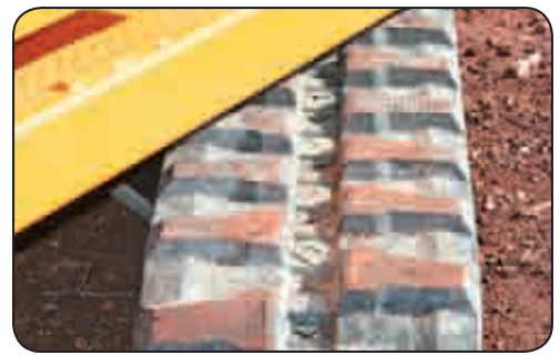
Caterpillar Rubber Track Undercarriage provides optimal traction in all situations.

The rubber tracks used on the Hurricane TRX are at home on both clearing sites and turf. The long and wide footprint of the Caterpillar tracks minimizes ground pressure. This allows the machine to float across soft ground, getting you to stumps that would otherwise be inaccessible. Another advantage of the rubber track system is the minimal damage done to asphalt or concrete. The rubber tracks truly do minimize damage to any surface!