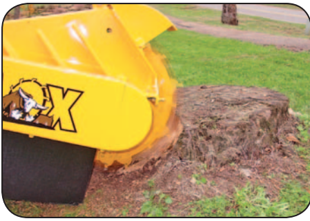
The SP7015's 26 1 / 2 -inch cutter wheel makes quick work of even the toughest stumps.