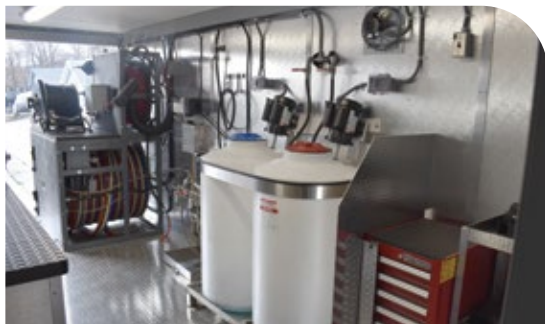
60-GALLON MIXING TANKS