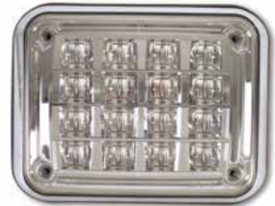
7" x 9"