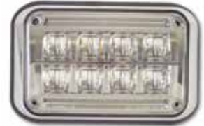
4" x 6"

Lamps shown with Bezels - ordered separately.