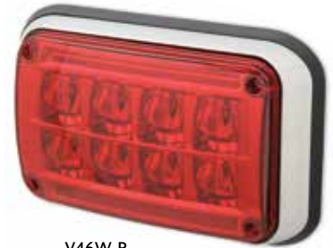
V46W-R Shown with Bezel OB80-2336-00