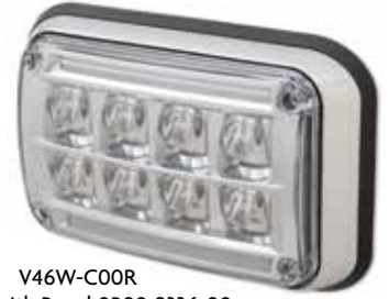
V46W-C00R Shown with Bezel OB80-2336-00