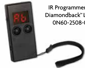
IR Programmer for Diamondback™ Lights 0N60-2508-00