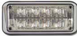
3" x 7"