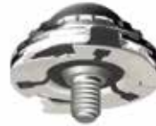
Patented V-LED design allows replacement of LEDs