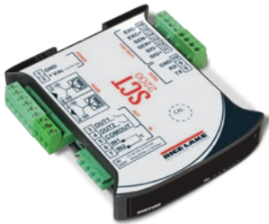
Optional SCT-2200 transmitter

Cable Length: 20 ft integral cable with blunt end termination