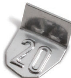
Leaf (Milligram) Weight