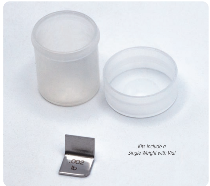
Kits Include a Single Weight with Vial