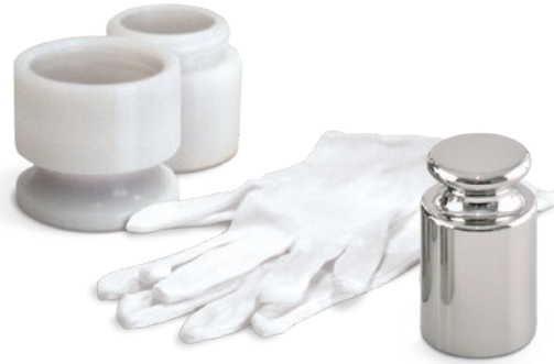
Kits Include a Single Weight with Case and Glove