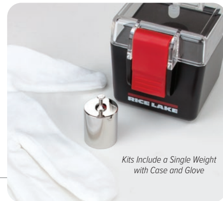
Kits include a single weight with case and glove

ASTM PRECISION OIML PRECISION BALANCE CALIBRATION STAINLESS FIELD WEIGHTS CAST IRON FIELD WEIGHTS SPECIALTY ACCESSORIES