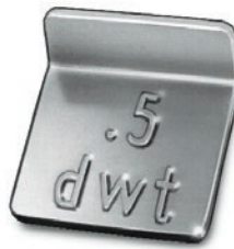
PN 12693 Pennyweight Leaf Weight