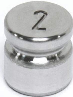
PN 12695 Cylindrical