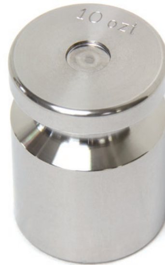
PN 12714 Cylindrical Weight