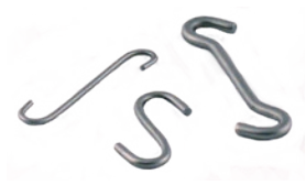
Hook (only) Weight (5g - 1g and (1/4-1/32 oz)