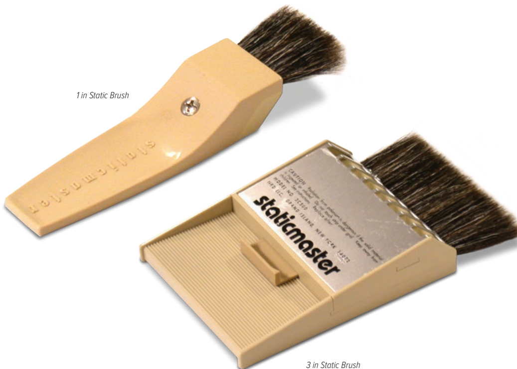
1 in Static Brush