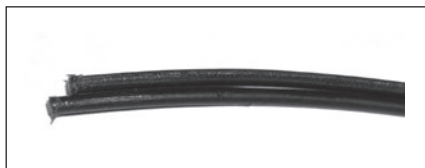
Color Code: Black-TXD, Blue-RXD