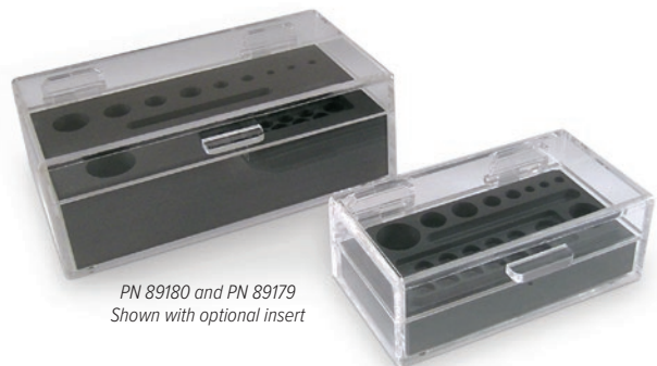
PN 89180 and PN 89179 Shown with optional insert