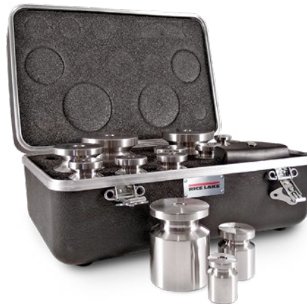
ABS Plastic Case (Weights shown are not included with case)